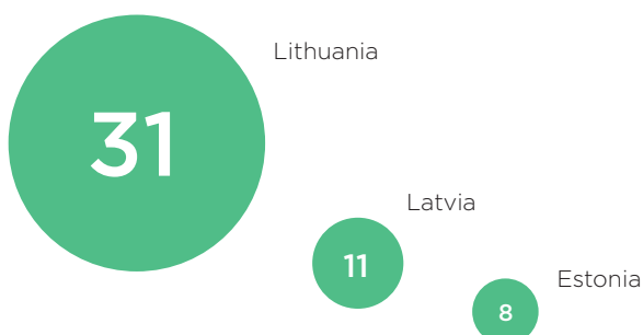
GRAPH 2: Coface Baltic Top 50 - Turnover per country in 2013 (EUR billions)